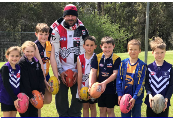
FOOTY COLOURS DAY