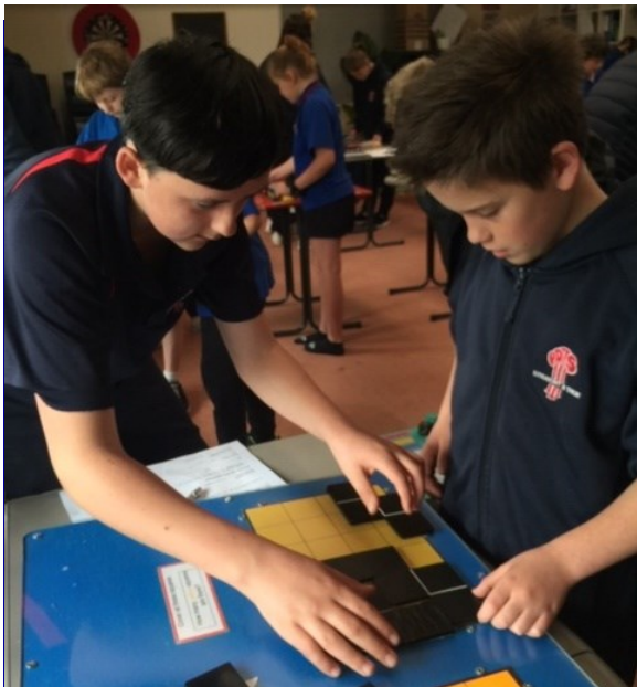
WORLD OF MATHS

The last week of Term Three has seen our Secondary students representing PDHS in Perth for the District High School Country Week, where they are competing in Volleyball and Badminton. They have displayed outstanding teamwork and sportsmanship throughout the week, representing our school and town with great pride.